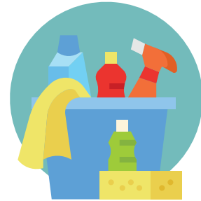
Full time sanitising and cleaning team in salon - daily deep cleaning