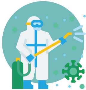
Fogging - regular virus eradication procedures throughout. 30 day protection