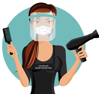
Minimal contact One-to-one service