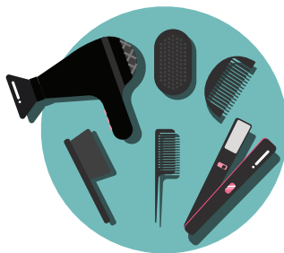
Single use equipment- full sanitation of combs, brushes and electricals prior to your appointment