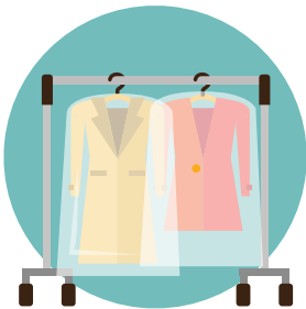
Your personal coat/ jacket protection.