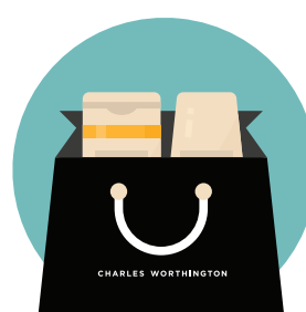
Retail purchases sanitised and singularly handled for you.