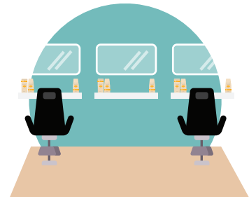
Single use sections - full sanitation prior to your appointment