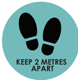
Social distancing markers throughout