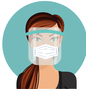
Daily team health checks and PPE