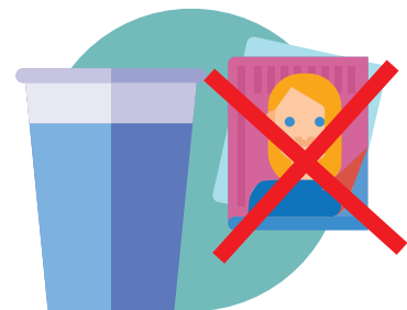
Disposable cups and no magazines or common contact materials