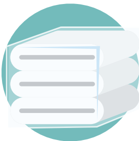
Prepackaged towels, gowns and disposable aprons